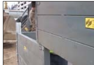
Panels fit on top of each other.