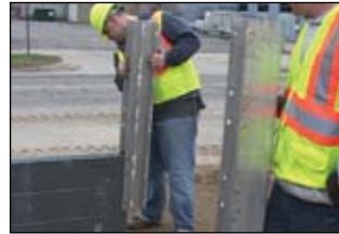
Corner end posts pinned on panels.