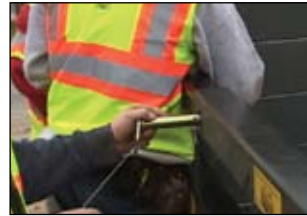
Pins secure panels to posts.