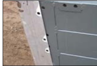
End panels are set into corner posts.